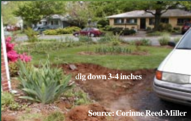
dig down 3-4 inches