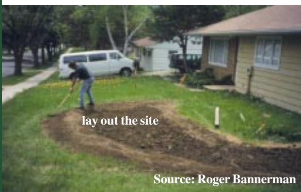
lay out the site

15 feet 15 feet 1/4 of the roof drains to one downspout = 15' x 15'