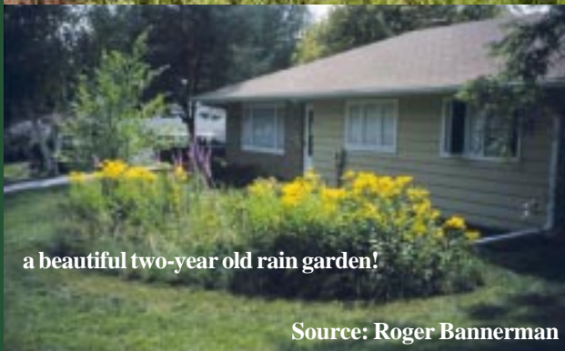
a beautiful two-year old rain garden!